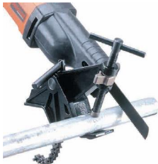
Press, pipe's sizes ½" - 2"

RS26 comes with a double acting pipe holder. Mechanical fastening pipe work in two ways. For smaller pipes you can use a clamp, and for larger – chain tensioner.