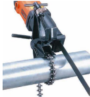
Chain, pipe's sizes until 6"